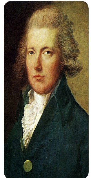
William Pitt the Younger

All new members who are under 40 years old automatically become members of the Pitt Society and will receive notice of upcoming events.